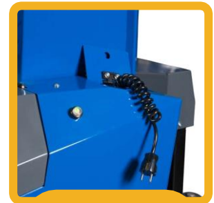
Big AGM Batteries Li-Ion As Option