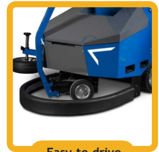
Easy to drive